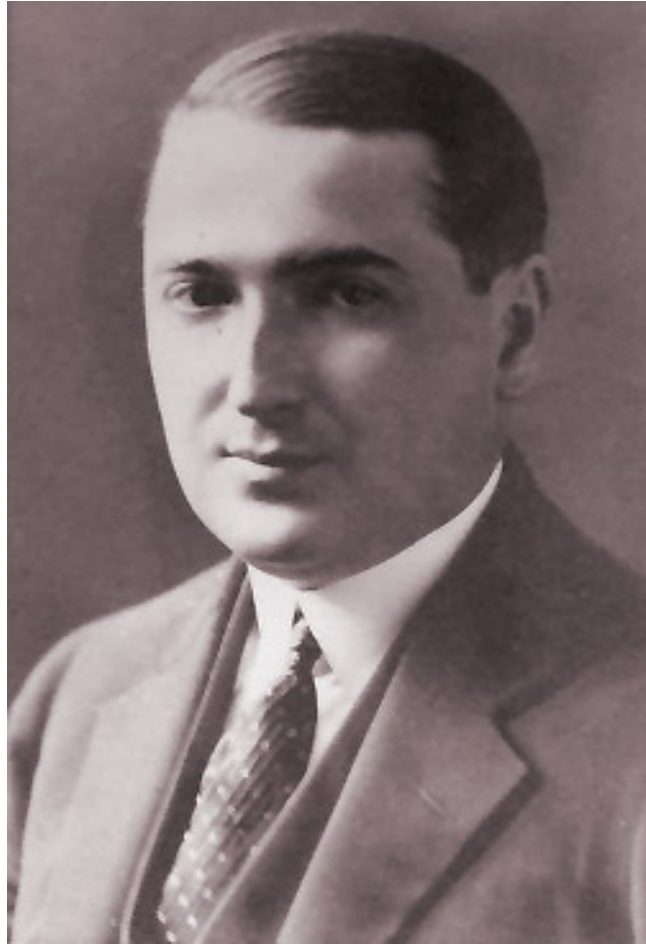
Emil Leon Post (1897–1954)