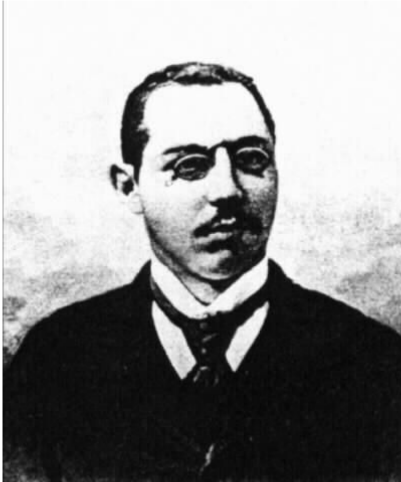
Giovanni Vailati (1863–1909)