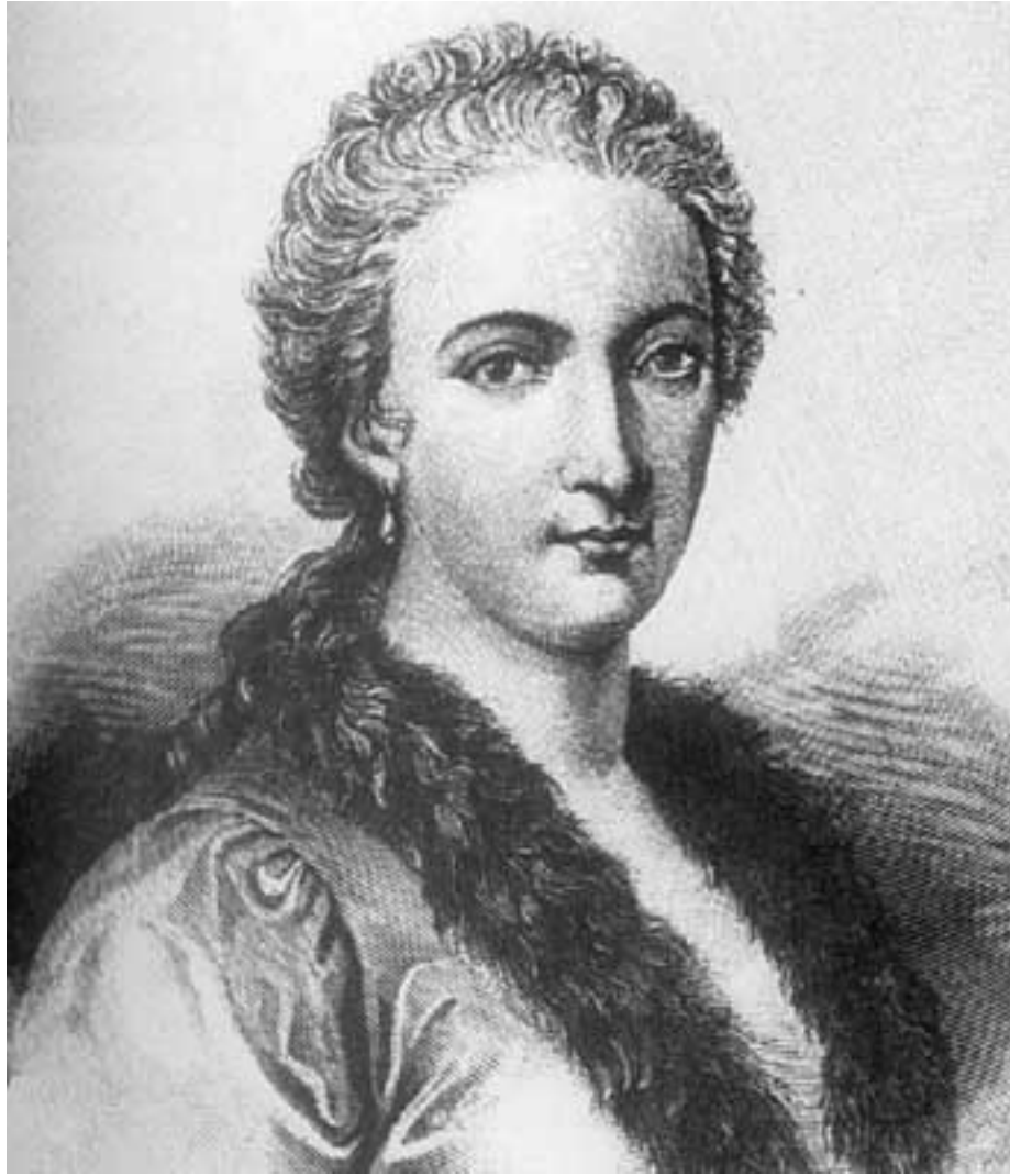
Maria Gaetana Agnesi (1718–1799)